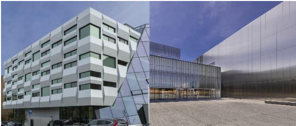
PLATE METAL CLADDING, SCREENS AND SHADING

SOLID, PERFORATED, AND FORMED PLATE METAL SYSTEMS KYNAR®, POWDER COATED AND ANODIZED FINISHES COMPLETELY RECYCLEABLE PRODUCT LOCALLY MANUFACTURED IN MARYLAND