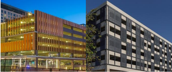
PLATE METAL SCREENS, LOUVERS, AND GRILLES

SOLID, PERFORATED, AND FORMED PLATE METAL SYSTEMS KYNAR®, POWDER COATED AND ANODIZED FINISHES COMPLETELY RECYCLEABLE PRODUCT LOCALLY MANUFACTURED IN MARYLAND